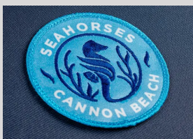
Print Stitch Patches