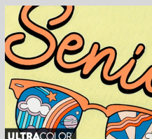
Full Color Transfers